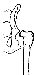
Hip dysplasia can range from mild to severe (top right to bottom right)