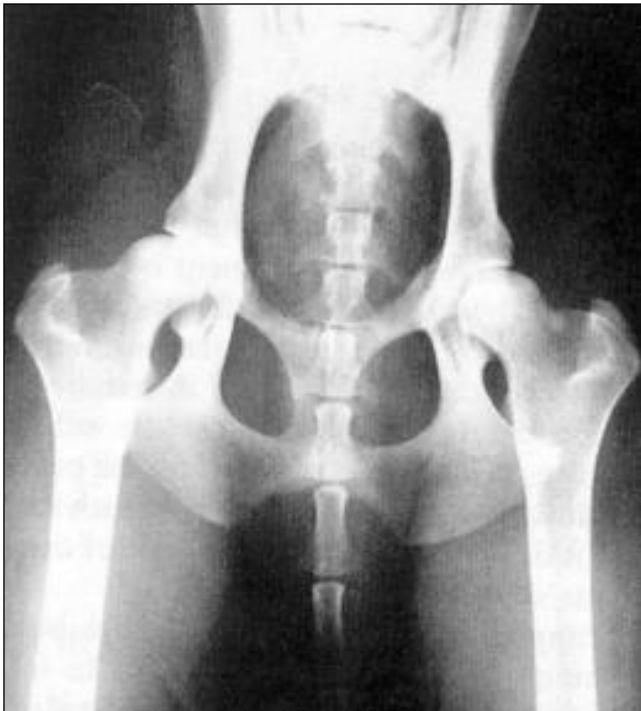
Ventre-dorsal x-ray of a dog with good hips

Hip dysplasia is a largely inherited condition seen mostly in the bigger breeds of dogs, such as the Alaskan Malamute, although environmental factors also play a large part in the soundness of the hip joint. The mode of inheritance is polygenic, meaning that a number of genes interact to determine the final physical characteristics of the hip joint.