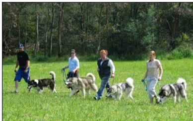
Obedience, Agility & Puppy Socialising

You do not need your own equipment – we will have equipment that you can borrow to try the activities. The Dog Shop will be there with harnesses, dog-lines, collars, backpacks and other working-dog and Malamute related items for sale.